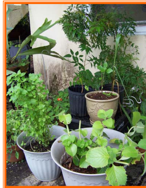
My herb garden

Chop all ingredients into bite-size pieces. Tumble peaches, plums, and apricots into a colorful display. Chop the dates into small pieces and place them throughout the dish. If you would like to, you can use \frac{1}{2} teaspoon of agave nectar or sprinkle with carob powder and then sprinkle on cinnamon to your liking. The beautiful thing about cinnamon is that it's a wonderful anti-inflammatory, which makes this awesome dish also medicinal. For the culinarian in you, arrange some edible flowers on this dish too. "Edible flowers?" you hark. Yes, edible flowers. They do exist. Ask your gourmet markets or local health food stores for edible flowers and have fun decorating this and other dishes. P.S. When you wanna go buck wild, add 2-3 tablespoons of shredded coconut on top... yummy