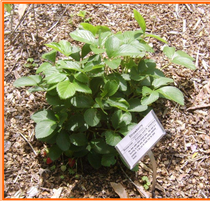
Botanical Gardens -Gainesville, FL - Strawberries

This is a protein rich meal or desert for those of us who make our way in the world strapped to our miracle machine, the computer. No butter on the keys, please! Taking a break is health giving.